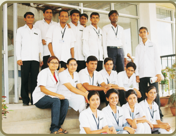
Students of Vananchal Dental College & Hospital

Vananchal Institute of Health Education & Research has been established to fulfill the ever increasing demand of qualified health manpower. It runs Paramedical Courses for 17 disciplines which is recognised by the Ministry of Health & Family Welfare, Govt. of Jharkhand. This institute offers paramedical courses such as Diploma in Physiotherapy, Medical Lab Tech., X-ray Tech., O.T. Assitt., E.C.G. Tech., Occupational Therapy, Dentistry, Hospital management, Pharma Sales Management, E.E.G / E.M.G. Tech., B.C.G. Tech., Mental Retardation Therapy, Biotechnology, Dietician, Food Inspector, Ophthalmic Assistant & Sanitation etc.