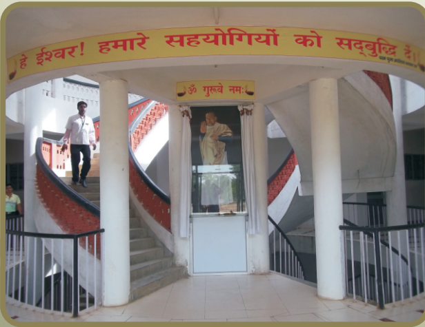
Administrative Block of Vananchal Dental College & Hospital

Devki Mahaveer Homoeopathic Medical College & Research Hospital offers 5½ years B.H.M.S. course under the management of Vananchal Educational & Welfare Trust®. This course is approved by the Government of India Ministry of Health & Family Welfare, Department of AYUSH, New Delhi & N.O.C. by the Ministry of Health & Family Welfare, Govt. of Jharkhand. The Nilamber Pitamber University, Medininagar has already issued N.O.C. This course is also approved by the Central Council of Homoeopathy, New Delhi.